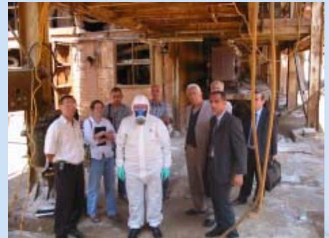
Procure equipment & tools