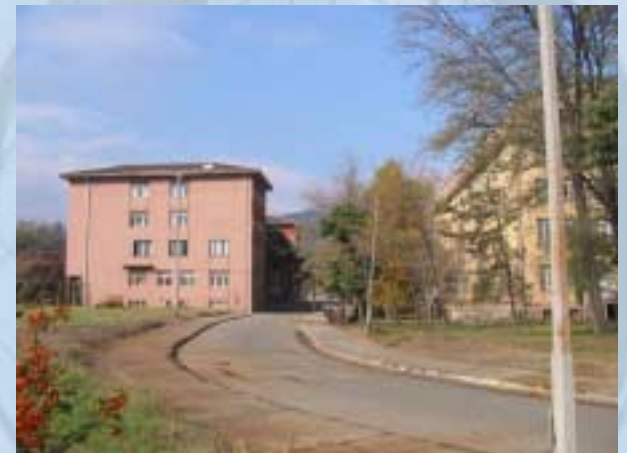
Rehabilitate laboratory and facilities