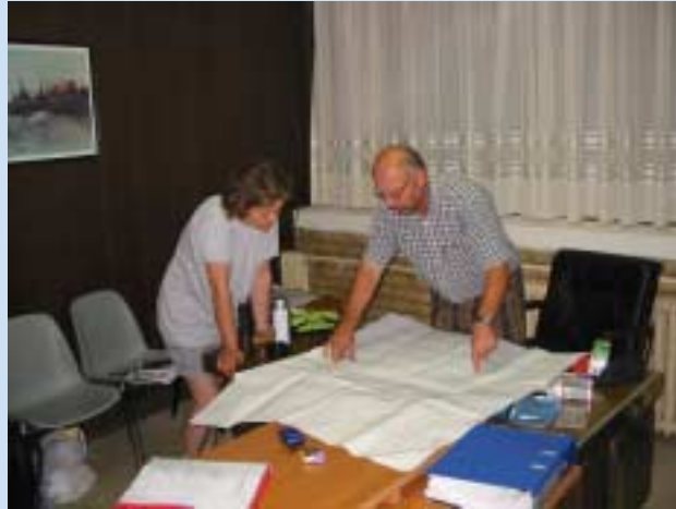
Training / Capacity Building